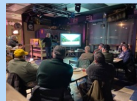
Expert guest speakers from around the world

The club has been involved in many stream restoration projects in both Michigan and Indiana. During the past year manpower and materials have been provided for stream improvement projects on the Dowagiac and Brandywine Creeks in Michigan and Cobus and Trail Creeks in Indiana.