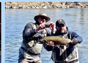
Steelhead, Salmon, Trout, Smallmouth Bass, Pike, Bluegill, Largemouth Bass!