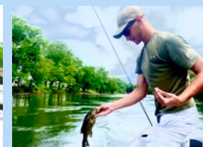
Members fishing with other members.