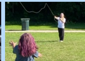
Free casting classes