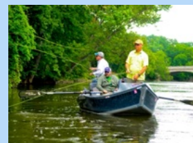
Many public access spots for wading and boats.

Throughout the year SJRVFF teaches the basic fundamentals of fly casting. Students are encouraged to bring their own fly rod, but the SJRVFF has a limited supply of fly rods to teach fly casting.