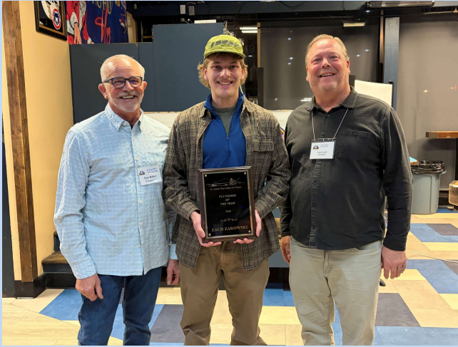
Fly Fisher of the Year