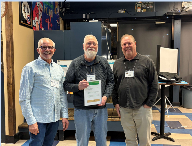
Oakie Drifter Award 1