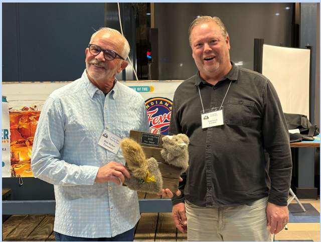
Oakie Drifter Award 2