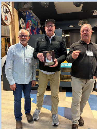
Joe Mitchell Award