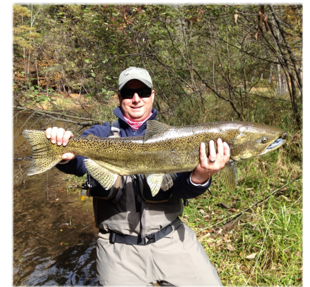
My Final Fish Envy (Hooked in the Mouth;)